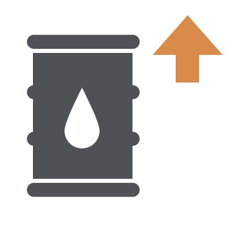
Crude oil prices remained elevated, driven by the Russia-Ukraine conflict, coupled with the reopening of several economies.

Multi-decade high inflation rates challenge the global economy. Inflation remained well above target in several major economies.